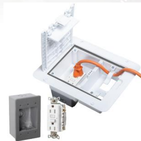
NM Deck Outlet Cover Kit