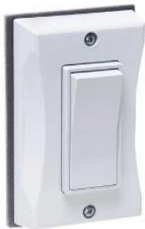
1-Gang Decorator Switch Cover