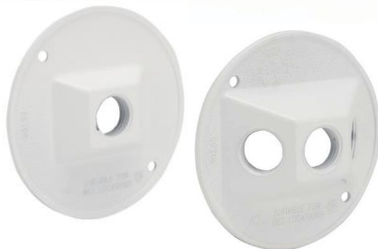
Lamp holder/Cluster Covers