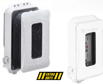
NM Low Profile In-Use Covers