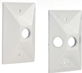
Lamp holder/Cluster Covers