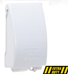
Metal Low Profile In-Use Covers