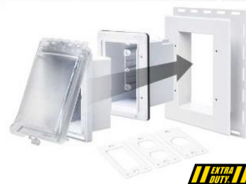
NM Recessed Enclosure Covers