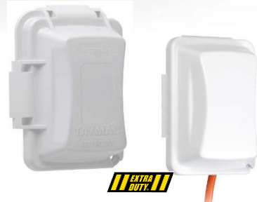
NM In-Use Covers