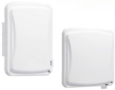
NM Flat Device Covers