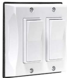
2-Gang Decorator Switch Cover