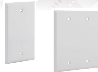
Blank Box Covers