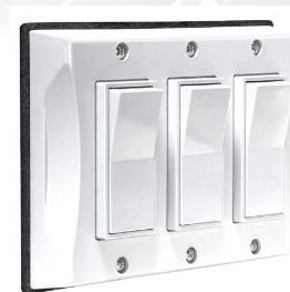
3-Gang Decorator Switch Cover