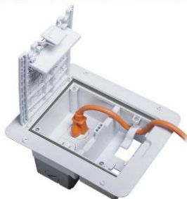
NM Deck Outlet Cover