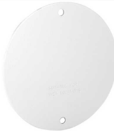
Round Box Covers